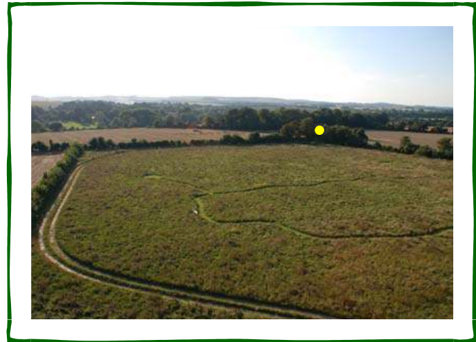
● – Red kite release site

Despite careful post-release monitoring and supplementary feeding, the rehabilitated leucistic kite died ten days post-release. This may have been due to leucistic birds being rare and possibly at a disadvantage to conspecifics resulting from their conspicuous plumage and presumed optic deficiencies. All kites avoided the centre of woodlands and utilized woodland edges or large hedgerows. There were no other observed fatalities during the period of post-release monitoring, indicating a confirmed mortality rate during the observation period of 12.5% for the group of mature kites, 75% for the young kites and 33% for the combined release.