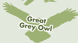
Great Grey Owl